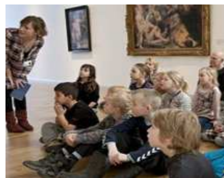
Statens Museum for Kunst www.smk.dk

TURRI School 2-6 years Scandicci Municipality